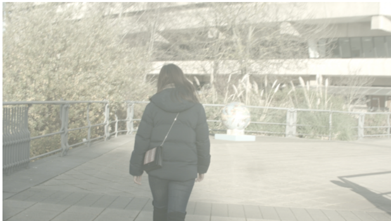
Screenshot from a trip to the National Archive

Indeed, “the struggle of man against power is the struggle of memory against forgetting.” And this quote from Czech-French Writer Milan Kundera is often being referred in Hong Kong and Taiwan’s social movements as we both experience histories (or presence) of censorship, thus memories become a public issue – and yet personal memories in a way still intertwined (e.g. the June 4 Tiananmen anniversary vigil in Hong Kong – as a way to remember and also create new memories related to an incident), the project would be exploring how these two types of memories are working together or against each other, and in what ways they would echo.